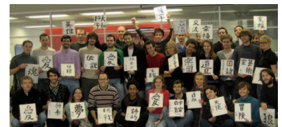
VULCANUS IN EUROPE AND JAPAN