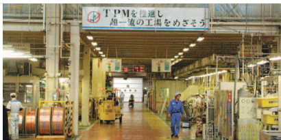
WCM: Shop Floor Visit

Distribution and Business Practices in Japan is a comprehensive 5/7-day training programme both for companies planning to enter the Japanese market and for those with some Japan experience but looking for new approaches to expanding their business there. It provides participants with a deep insight into the Japanese market and consumers' needs through lectures, seminars, case studies, field trips and visits to wholesalers, distribution centres and retailers. (convenience stores, general merchandise stores and supermarkets)